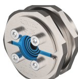
C RS T kit

For detailed information, please visit roxtec.com .